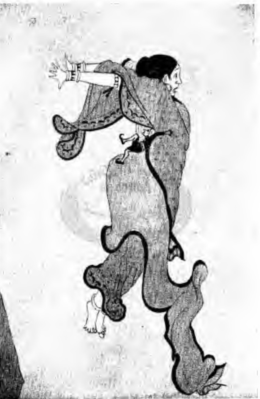
Goutia Deo carries the lady through the air.